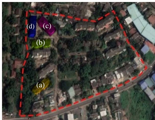
Figure 1: Scheme layout with orientation

Indoor thermal comfort is a crucial consideration in building design, as it directly impacts the satisfaction and productivity of building occupants. Ensuring that residents can maintain a comfortable living environment within their budget is particularly important in the context of affordable housing. Energy costs, especially those related to cooling, constitute a significant expense for buildings in Sri Lanka. By employing passive methods to achieve optimal indoor thermal comfort, it is possible to reduce energy consumption and, consequently, the overall cost of housing. This research aims to analyse the indoor thermal comfort of condominium housing, with a specific reference to how thermal comfort is influenced by the factors such as orientation, apartment height, surrounding vegetation, and proximity to other buildings. Elapitiwela Housing Scheme in Welisara, Ragama was chosen as the focus of this study, based on its unique characteristics that make it an ideal case for investigating indoor thermal comfort in condominium housing.