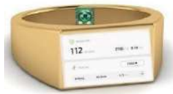
Figure 2: Final Design