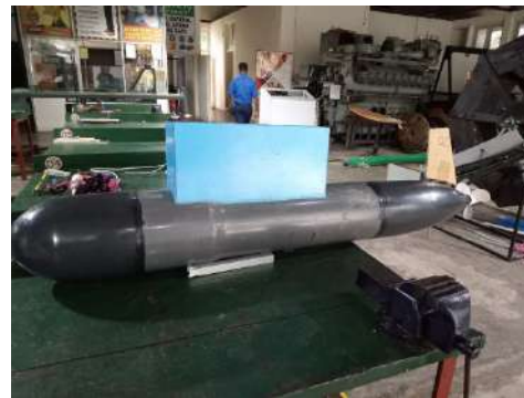
Figure 1. Construction of AUV hull by PVC pipe

the standard shape of the AUV (Alvarez, et al., 2009). Further, components of the hull are easily detachable and maintainable. The PVC hull and anticorrosive marine paints applied on the hull provides complete hull protection against corrosion. Watertight integrity and dryness inside the hull are of paramount importance in AUV operation, which is achieved by simple mechanical fastenings.