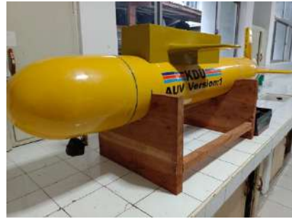
Figure 6. Illumination device

KDU AUV (version 1) is equipped with 12V waterproof light to provide illumination required for shallow-water exploration (Leathermen & Leatherman, 2017). For the version I, we have used a basic light considering the cost-benefit and it is installed at the forward underwater surface of the vessel with a fixed mounting.