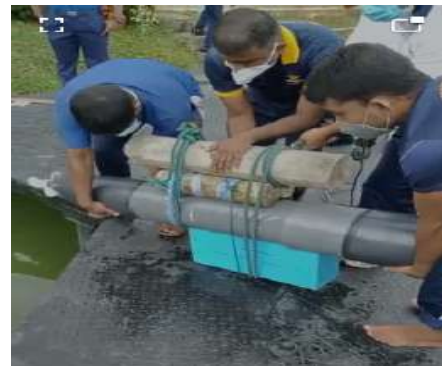
Figure 4. Preliminary stability testing at KDU lake.

neutrally equilibrium condition even in extreme wave conditions. The constructed vessel was tested at sea and KDU swimming pool under varying wave conditions to ensure safe operations in both sea and freshwater conditions.