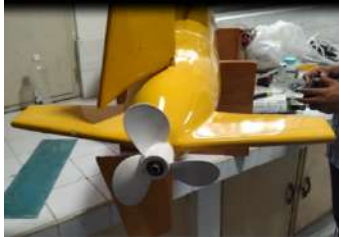
Figure 5: Rudder testing at hydrodynamics laboratory, KDU

lift to maneuver the vessel even against strong wave conditions. Further, improved response to the command is another cause of improved maneuverability of our design. These rudders are operated with linear actuators and capable of changing its course as per the given command by the rudder control system. However, the fixed planes provide stability to the vessel.