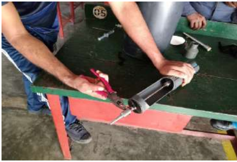
Figure 2. Preliminary stages of construction of AUV

impacts on the hydrodynamics of AUV. With this propulsion system, the speed of the vessel can be varied by a wireless remote controller, overriding the function of a conventional AUV and optimizing its capabilities in rough sea conditions. Figure 2 and Figure 3 depicts the preliminary stages of construction of AUV.