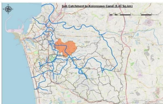
Figure 1- Selected Geographical Scope Sub-catchment to Kolonnawa Canal

For the purpose of water quality analysis in the study, the selected geographical scope is an area belongs to the sub-catchment to Kolonnawa canal which has an area of 5.43 km 2 . Sub-catchment in Figure 1 is the collection of four Metro Colombo Wetland (MCW) zones namely, MCW 06 (Kolonnawa East-Gothatuwa), MCW 07 (Kolonnawa South-Madinnagoda), MCW 11 (Kolonnawa-West Salamulla) and MCW 12 (Kolonnawa-West Yakbedda).