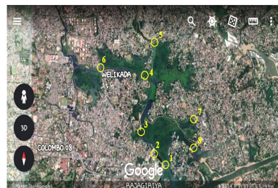
Figure 2 - Locations of Water Quality Measuring Points

Selection of sampling locations was done based on several factors. In order to calculate GWF, pollutant loads coming into the canal were to be found. Since there are many waterways which bring water to the canal and marsh, testing water quality and flow rate of each and every one of them for baseline method of GWF calculation was not practical. Therefore, water quality and flow rate of the canal was directly tested and measured from the canal itself from several locations which hold significant importance. As the quality of water which comes through residential areas was needed to be assessed, some peripheral waterways which receive residential wastewater were also selected. Other than these reasons, ease of access also played a significant role on location selection as many discharge points of smaller waterways were not easily accessible. Sampling points shown in Figure 2 were selected across the Kolonnawa canal and its peripheral water canals due to the reasons shown in Table 1. Water quality parameters pH, DO, BOD 5 , TDS, EC, COD, salinity, conductivity, temperature, NO 3 -N and PO 4 -P as defined by Environmental Protection Agency, (2001) were checked at these locations. Three sets of data were collected with 10 days intervals. The collected data were used to analyse the