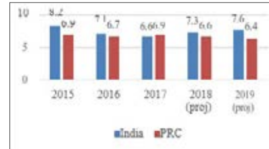
Figure 01. Economic growth rates of China and India (2015- 2019) Source: Asian Development Outlook 2018, Asian Development Bank

unresolved territory dispute, mutual suspicions over each other’s military strength, and geopolitical rivalry for the supremacy in the Indian Ocean, both countries continue to maintain strong economic ties, particularly in terms of trade and investment. Looking at trade statistics, the bilateral trade between India and China in 2017 rose by 18.63% year-on-year to reach US$ 84.44 billion. It’s registered as a landmark as the volume of bilateral trade for the first time touched US$ 80 billion, well above the US$ 71.18 billion registered last year (THE TIMES OF INDIA, 2018). Looking from an economic perspective, over the last decade both India and China have able to achieve healthy economic growth, and projected to continue that success in the coming years as well (Figure 01).