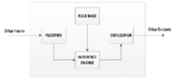
Figure 1. Overview of a Fuzzy Logic System (Almohomodi and Hagrass, 2013)

Initially presented by Zadeh (1965), Fuzzy Logic is considered an efficient user modelling technique in adaptive e-Learning, specifically as it can mimic the logical reasoning process of humans (Bih, 2006). Learning-teaching behaviour is represented in a human readable and linguistically interpretable manner through the use of fuzzy rules. The Fuzzy Logic System (FLS), as represented in Figure 1, consists of four components: Fuzzifier, Rule base, Inference engine and Defuzzifier (Mendel, 1995).