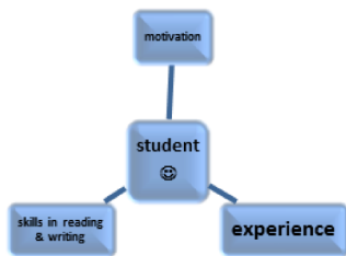
Figure 4: student-related challenges

The most common challenges (both teacher and student related) that the majority face are giving students sufficient and effective individual feedback, students' limited experience in directing higher order thinking and their skills of in-depth reading and effective writing in academia. The