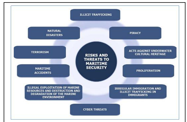
Figure 2. Risks and threats to maritime security

When the above aspects are incorporated to maritime security in the national strategy, the risks and threats to national maritime security depicted in figure 2 can be neutralized;